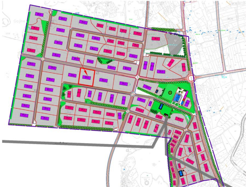
Business zone Volujac