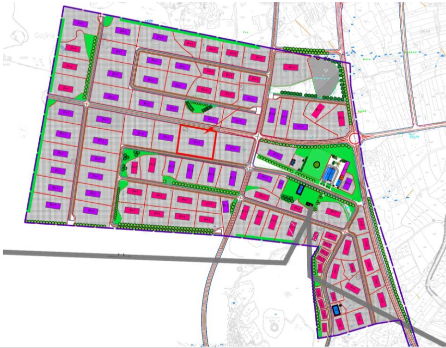
Business zone Volujac