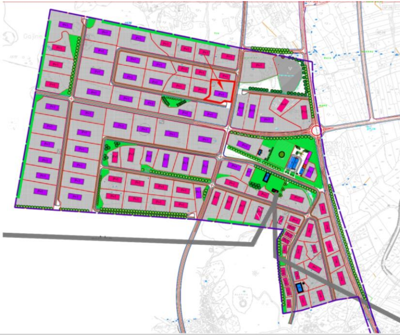
Business zone Volujac